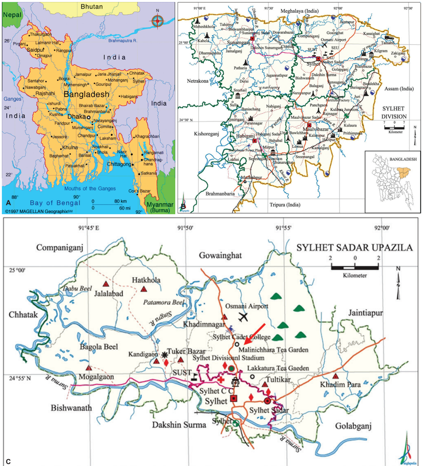
Figs 1A to C: (A) Map of Bangladesh; (B) Map of Expanded Sylhet District; and (C) Map of Sylhet Sadar Upazila

Division (Fig. 1B) in broad sense and specifically, under Sylhet Sadar Upazila (Fig. 1C). Malnicherra is shown by a red arrow in Figure 1C. Sera were collected from the workers of Malnicherra tea gardens and checked for HBsAg and anti-HCV. The HBV genotype was accomplished in sera that were expressing HBsAg with detectable levels of HBV deoxyribonucleic acid (DNA).