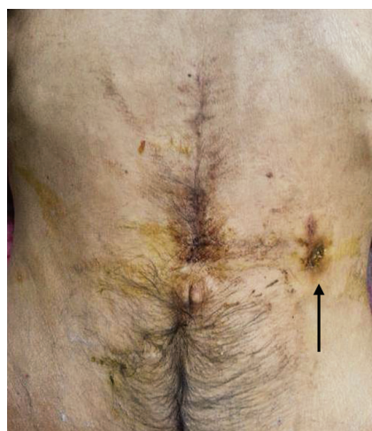
Fig. 1: Jejunostomy site and healthy abdominal scar

A 40-year-old gentleman presented to the emergency department with complete internalization of the feeding jejunostomy for 1 day. Patient was evaluated for dysphagia 6 months earlier and was found to have carcinoma nasopharynx. In view of absolute dysphagia and failure to pass nasogastric tube, feeding jejunostomy was done using a 12F ryles tube. Patient was subjected to definitive chemoradiotherapy and dysphagia resolved. He was lost for follow-up thereafter. On examination, patient was hemodynamically stable and tolerating oral diet. Abdominal examination was soft with the feeding jejunostomy site and the abdominal scar healthy (Fig. 1). Per rectal examination was normal. Abdominal X-ray revealed