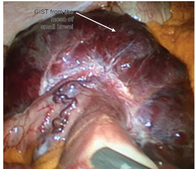
Fig. 2: An encapsulated mass lesion originated from the meso of small intestine

A 60-year-old male with a body mass index of 47 kg/m 2 was admitted to Kecioren Training and Research Hospital, Ankara, Turkey. Type 2 diabetes mellitus and hypertension were present. Laparoscopic sleeve gastrectomy procedure was planned for morbid obesity. Routine laboratory tests, abdominal USG, and upper gastrointestinal endoscopic examination were normal. During the surgery, a red-colored and seemingly encapsulated mass lesion that was thought to be originated from the mesothelium of small bowel, and which was situated under a 4-cm segment of small intestine, was detected (Fig. 2). Exploration was started by open surgical technique, and other sites were found to be clear. The mass and associated intestinal segments were resected, and the remaining open ends were anastomosed. Operation was completed following the drain tube placement. The histopathological examination of the 12.5 × 10 × 7-cm-sized, deep red-colored nodular mass that carried a 4-cm small