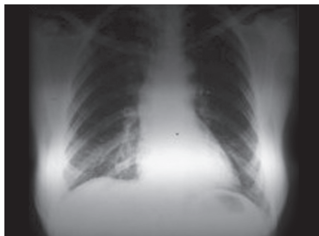
Fig. 1: The chest radiography shows bilateral infiltrative appearance being prominent in the lower lobe of the right lung

The treatment of PEG IFN alpha-2a 180 µg/once a week and ribavirin 1000 mg/day was initialized for a 46-year-old female patient with the diagnosis of chronic hepatitis C, genotype 1b. Hepatitis C virus (HCV) Ribonucleic acid was <15 copy/mL in the 12th week of the treatment and negative in the 24th week. The patient applied to the gastroenterology clinic with the complaint of dry cough and shortness of breath in the 28th week of the treatment. The patient did not have a history of pulmonary disease. Physical examination revealed bilateral crepitations at the lung bases. The laboratory values in this period were normal apart from the hemoglobin of 11.2 gm/dL. The department of chest diseases was also consulted. Bilateral infiltrative appearance being prominent in the lower lobe of the right lung was detected in the chest radiography (Fig. 1) and high-resolution torax tomography demonstrated crystallization in the interlobular septates in the lower lobe of both