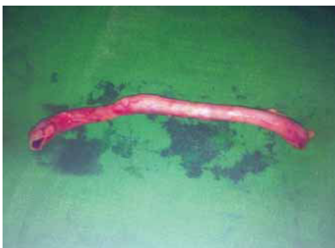
Fig. 4: Photograph showing specimen of appendix (9 cm)

colon or urinary bladder on the left. One should suspect the presence of appendix in such conditions, although it is rare. 1,2 Usually, surgeons proceed with surgery only with a clinical diagnosis for inguinal hernias unless otherwise a complication is suspected as in strangulated or obstructed hernias. Amyand's hernia is usually an intraoperative finding. A preoperative ultrasonography and CT abdomen could complement in such cases, though it is routinely not practiced when a clinical diagnosis of inguinal hernia is evident. 2-4 The presence of adhesion of appendix to the sac could be attributed to the congenital inguinal hernia with the patent processes vaginalis. 2,4 Although, most of the authors prefer not to do an appendicectomy in an Amyand's hernia as it can add to contamination of an otherwise clean field and recurrence. 5 In our case, after reducing the hernia by conventional approach the appendix was adherent all along the sac, therefore it was inevitable for us to perform appendicectomy though it appeared