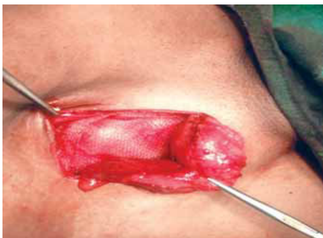
Fig. 3: Operative photograph showing tension free meshplasty completed