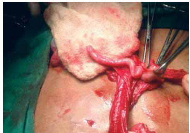
Fig. 1: Intraoperative photograph showing appendix and cecum as contents in the hernia sac

Large or huge inguinoscrotal hernias are usually sliding hernias with cecum and bladder on the right and descending